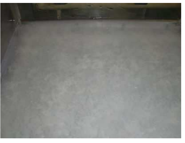
Product after 3 hours of agitation in slosh box

The percentage of the replicate articles tested for which the percentage of the article's initial dry mass passes through the 12.5 mm sieve after 3 hours is greater than 25% is 100%.