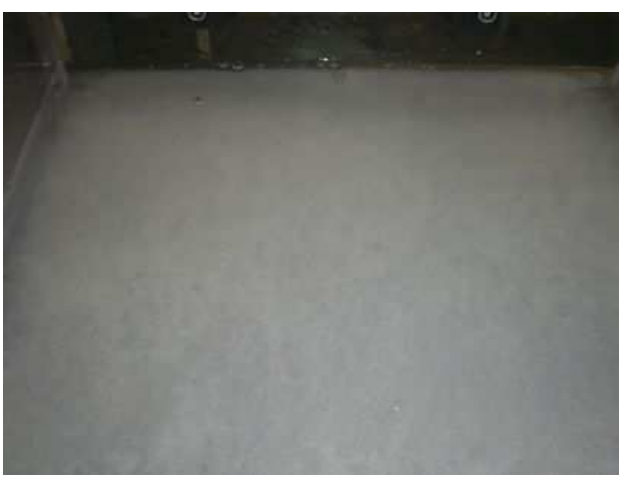
Product after 3 hours of agitation in slosh box

The percentage of the replicate articles tested for which the percentage of the article's initial dry mass passes through the 12.5 mm sieve after 3 hours is greater than 25% is 100%.